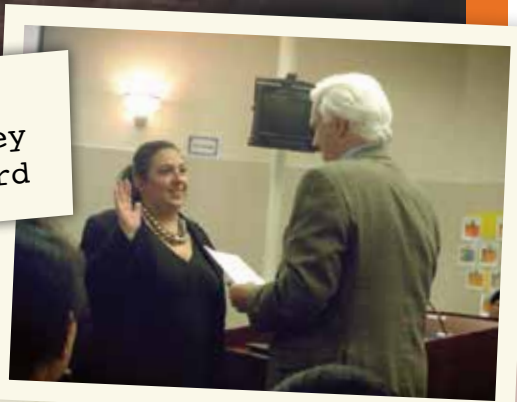
Getting sworn in to the Franklin-McKinley School District Board