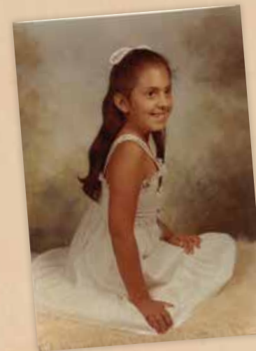
I was born and raised in San Jose and have spent my life giving back to our community since I was a girl.