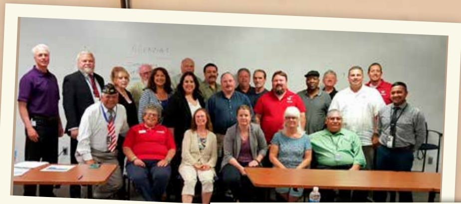
Veterans Voices of Santa Clara County meeting. I'm a co-founder.