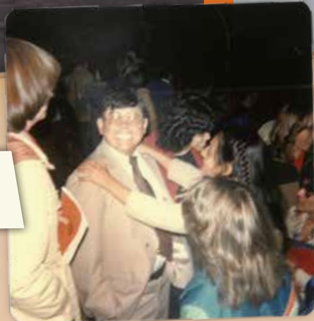
My family taught me to help others.