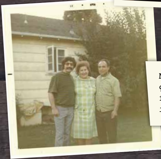
My father and grandparents in front of their home in San Jose.